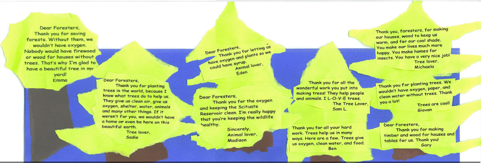
Thoughtful expressions of thanks to our local woodland owners courtesy of North Scituate Elementary 3rd Grade Students.

and educational association representing the forestry profession in the United States.