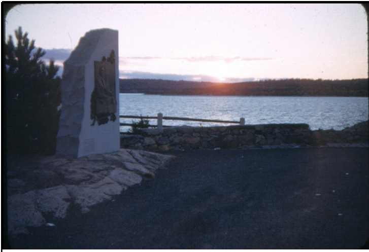
Gainer Dam, Scituate, RI

The Scituate Reservoir, as a water body (surface water) is kept at high levels by inflowing groundwater from surrounding land.