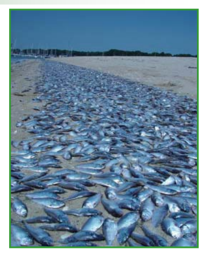
Above: Fish kill on Greenwich Bay as a result of increased nitrogen and a loss of oxygen, August 2003.

Phosphorous is the nutrient of concern in freshwater systems like ponds, streams, and reservoirs. Excess phosphorous levels can have the same effect on fresh water bodies, such as the Scituate Reservoir. Since 60% of Rhode Island residents get their water from the Scituate Reservoir, maintaining low phosphorous levels are extremely important.